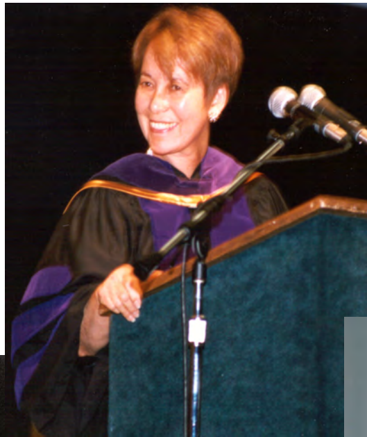
Notable commencement speakers have included (top to bottom): The Honorable Joyce Kennard, Associate Justice of the California Supreme Court; Willie Brown, Mayor of San Francisco; and Patricia Ireland, President of the National Organization for Women.

If a student is unable to complete a trimester's work, or is unable, after completion of a trimester, to return for the next regular trimester, the student must, in order to regain the right to return to the School of Law, either take an approved break (Standard Period of Non-enrollment) or withdraw and be readmitted. Readmission is permitted either by approval of the Dean or the Academic Standards Committee, depending on the student's status at the time of withdrawal (see Section 5 of Empire College School of Law Policy Manual).