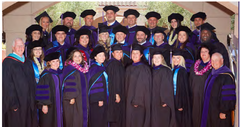
Congressman Mike Thompson (front row, left) delivered the commencement address to the Class of 2016.

Students should retain copies of all forms and information sent to and received from the Committee of Bar Examiners.